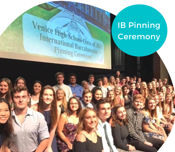
IB Pinning Ceremony